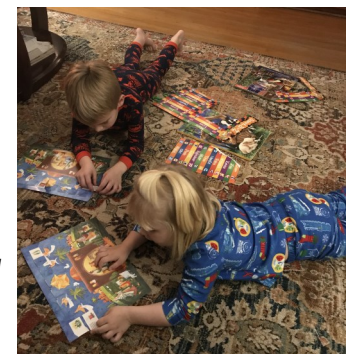
Snodgrass children enjoying their Advent Calendars.