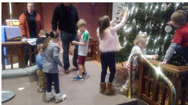
Decorating Christmas Tree

2/24/19- ALL YOGS - Bowling outing Sunday 5-8 p.m. More details to follow.