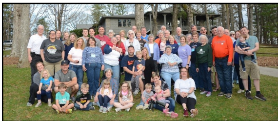
2020 Congregational Retreat at Lutheridge April 24-26, 2020