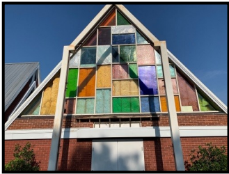
Old Sanctuary stained glass gable wall

Thank you again from the Property Committee in helping to continue striving to maintain our extensive facilities in a pleasing and cost effective manner.