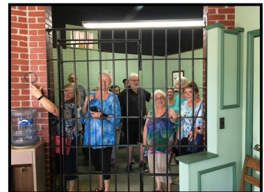
Having fun in the Mayberry jail.